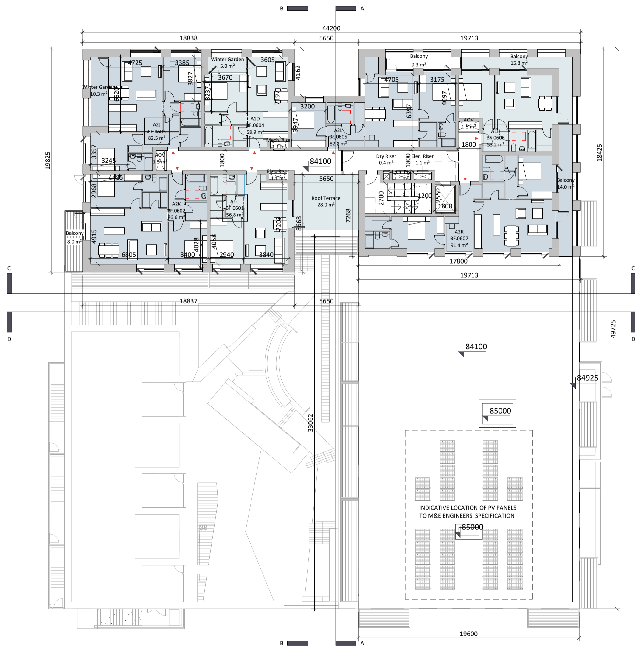
1 Block F Level 06 1:200